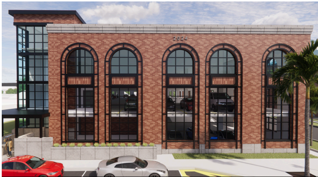
© Sol Design Studio - Project Architect