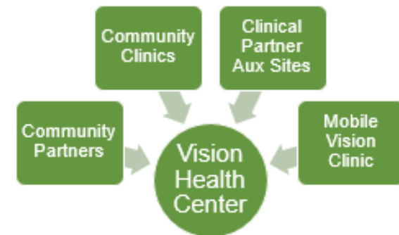
Hub and Spoke Model

Like spokes on a wheel, there are many elements involved in improving healthcare access for people of all ages. For years, LWVI has been building these vital components—tackling obstacles like limited transportation, lack of health insurance, financial barriers, and language challenges. The Vision Health Center will serve as the hub that brings all of these efforts together. Without this central point, children may struggle with educational success, adults could face barriers in maintaining their independence and work productivity, and seniors remain at increased risk of falls, injuries, cognitive decline, and social isolation. The Vision Health Center will be the crucial connection point needed to provide comprehensive, accessible care, impacting thousands in Tampa Bay and creating a replicable model for other LWVI service areas.