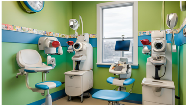
CHILDREN'S VISION SPACE