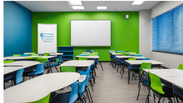
EDUCATION AND TRAINING

Visit www.lwvi.org for additional renderings and project updates