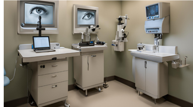
STATE OF THE ART EQUIPMENT